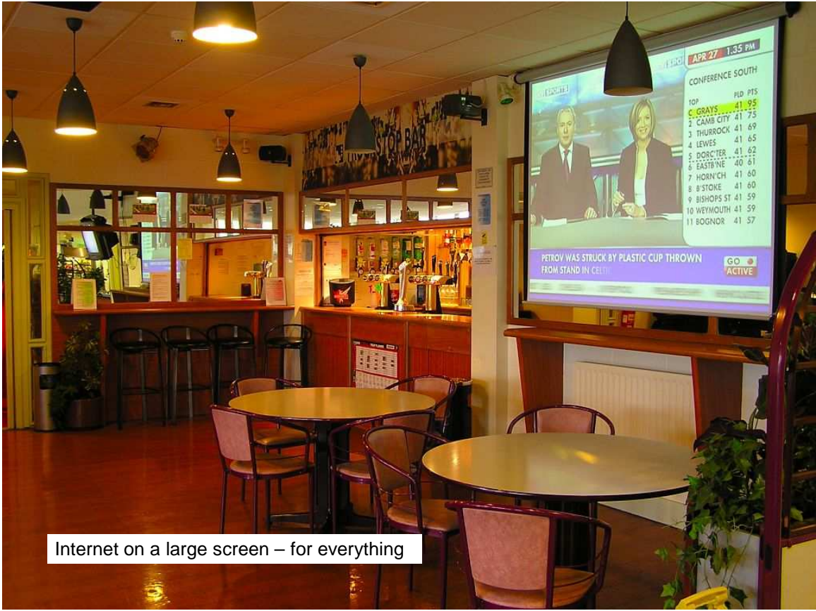
Internet on a large screen – for everything